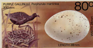
Grenadines of St. Vincent