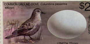
Grenadines of St. Vincent