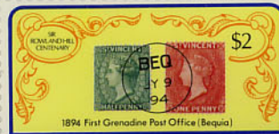
Grenadines of St. Vincent