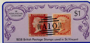
Grenadines of St. Vincent