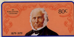
Grenadines of St. Vincent