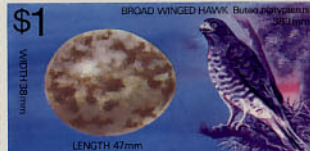
Grenadines of St. Vincent