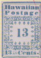
"Hawaiian Missionary" stamp 1851