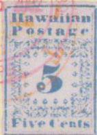
"Hawaiian Missionary" stamp 1851