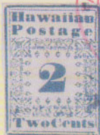
"Hawaiian Missionary" stamp 1851