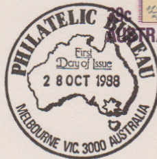
1855/56-South Australia n° 1 to 7 € 28'500 SOS-1988-Australia POSTAL CARD 100° Organised Philately