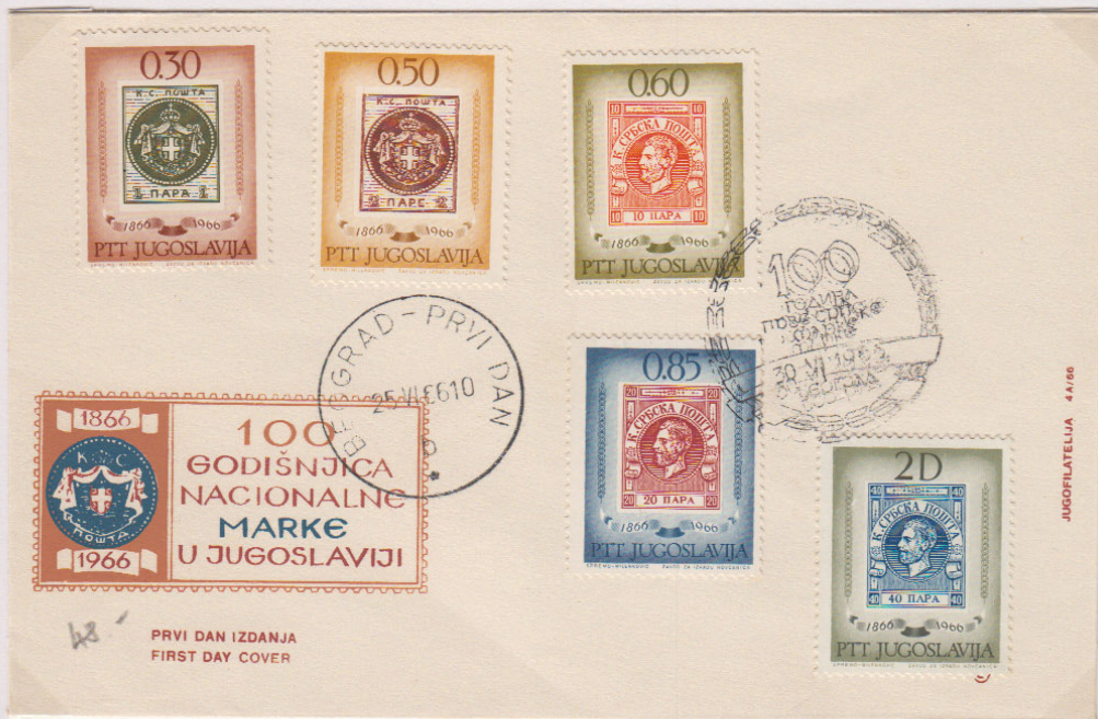
1866 June, 1 SERBIA 1, 2, 10, 20, 40 para € 3'850 SOS-1966-Yugoslavia Y&T n° 1057/8/9/60/61